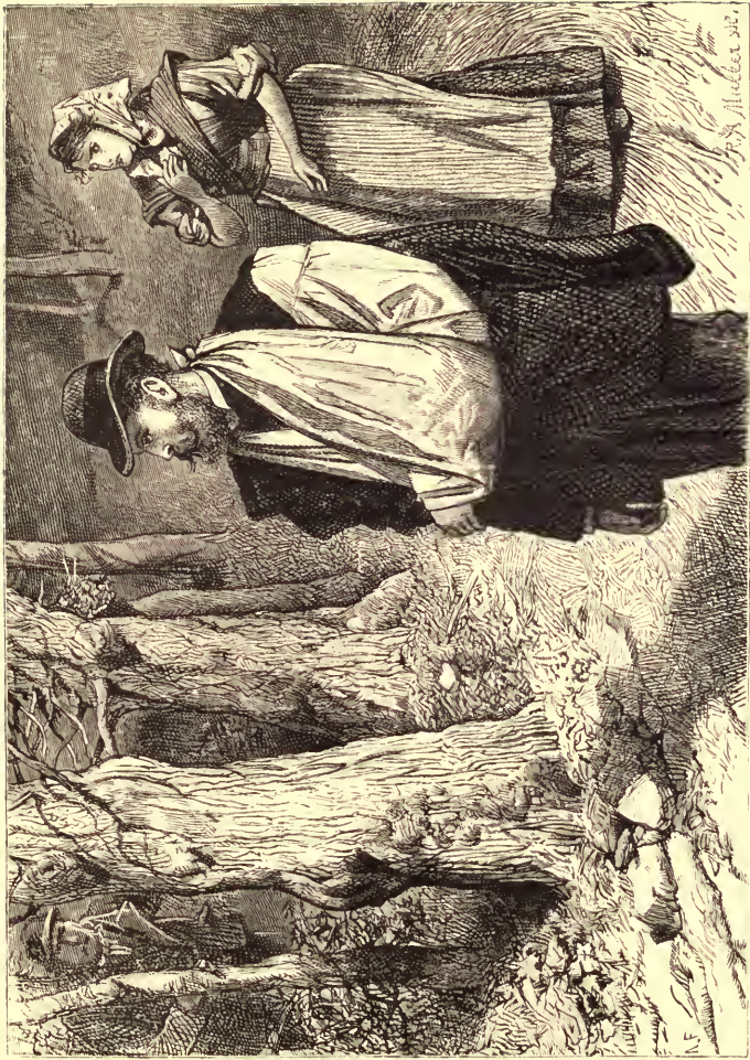
Joan halted suddenly.